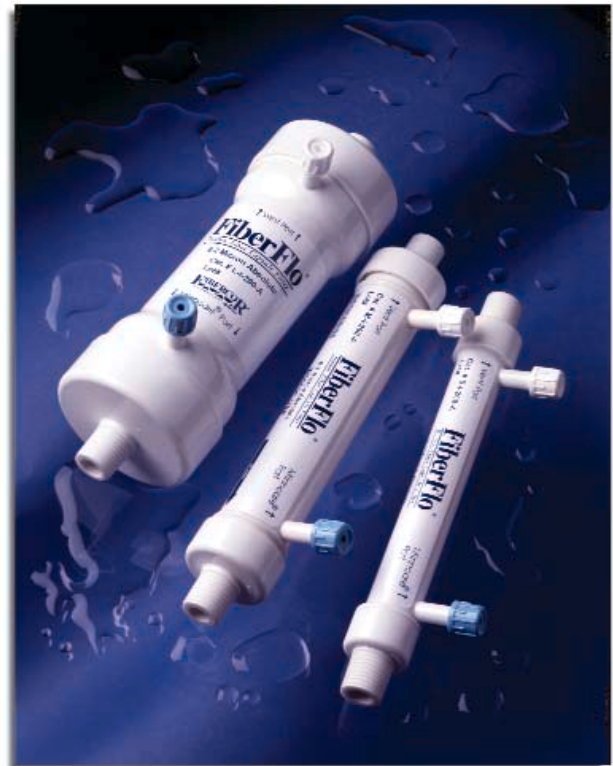
Compact Size— Larger Filter Area

Minntech Filtration Technologies manufactures FiberFlo capsule filters to medical device quality standards with adherence to QSR manufacturing guidelines. These filters exceed the requirements of USP Class VI Plastics Testing and meet USP XXIII standards for purified water extractables. FiberFlo HF capsule filters are integrity testable by diffusional or forward flow methods.