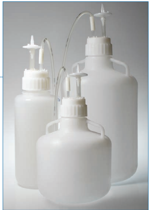
Bio-Simplex™ Container Closure System featuring the EZ Top® Assembly and cap.

The Bio-Simplex™ Carboy Closure System features an EZ Top® Closure Assembly made from C-Flex® pharmaceutical grade resin and tubing, engineered to ensure an unobstructed fluid path, extremely low levels of extractables and a secure elastomeric seal against plastic, glass and metal surfaces. The EZ Top® Assembly includes C-Flex® tubing with standard plug end fittings, a Bio-Simplex™ Flex Joint™, 0.2 µM vent filter and cap. Economically designed for single use, the system eliminates cleaning and contamination from repeated use. It is easily used with sterile connecting devices and thermal tubing sealers. We offer standard 2 and 3 port configurations to fit a wide variety of carboys in sizes from 5 to 20 Liters. Available as a complete packaged Bio-Simplex™ Carboy Closure System (EZ Top® Assembly, carboy and cap), either gamma irradiated or non-irradiated; or as individually packaged EZ Top® Closure Assemblies. Custom designs, materials, sizes, packaging and other options—such as quick disconnect devices, Luer connections, heat-sealed ends or alternate carboy materials—are available on request.