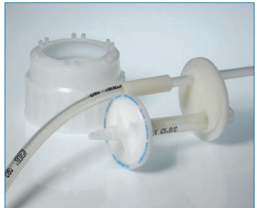
EZ Top® Assembly and cap